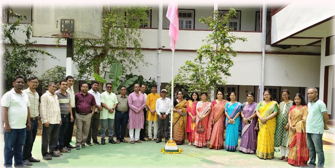
Faculty members of the college