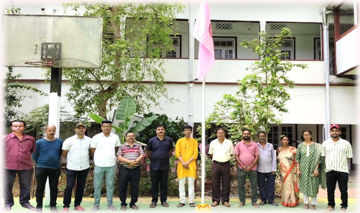
Office staff of the college