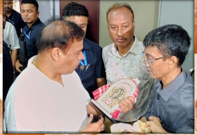
Dr. Himanta Biswa Sarma, Hon'ble Chief Minister of Assam (6 th June, 2025).